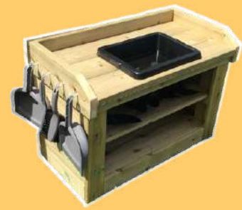
Mud Sink NLCOM-110