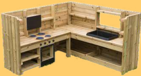
Messy Corner Kitchen NLCOM-150