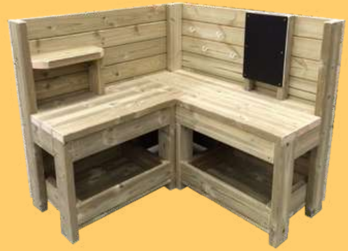
Mini Corner Mud Kitchen NLCOM-176

Mud kitchens encourage children to play together where they build skills in negotiation and teamwork.