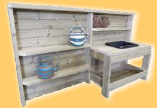
Utility Kitchen NLCOM-119