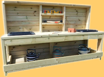
Mud Kitchen NLCOM-112