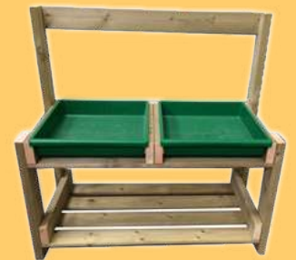
Creative Kitchen NLCOM-169

"Newby Leisure are and will always be our preferred suppliers. You tick all the boxes for us. The quality of materials, the workmanship and the first class team are just the ticket. With us there's a project every year if we can afford it. The sketches always help us visualise the end result, but Newby Leisure has never failed to make the end project look soo much better than the sketch.