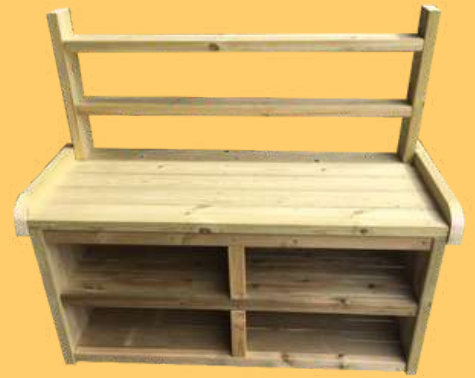
Wooden Workbench NLCOM-196